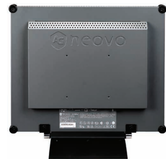
Front-panel keypad with Input Select, Screen Menu, Contrast and Brightness controls for quick adjustments