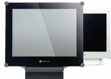
Available in black or white