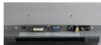
Wide range of I/O connectors for flexibility and expandability in endoscopic video installations